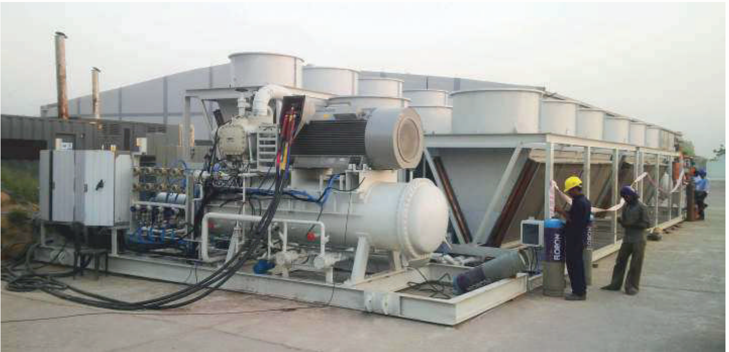
1000 TR, Air cooled, HT Motors, Transmitter based