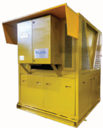
Inverter Based Scroll Chiller