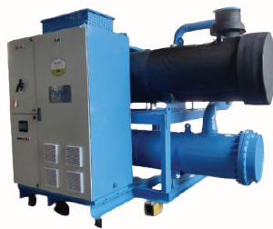
Variable Speed water cooled Screw Chiller