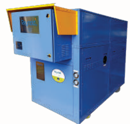
Air Cooled Scroll Chiller