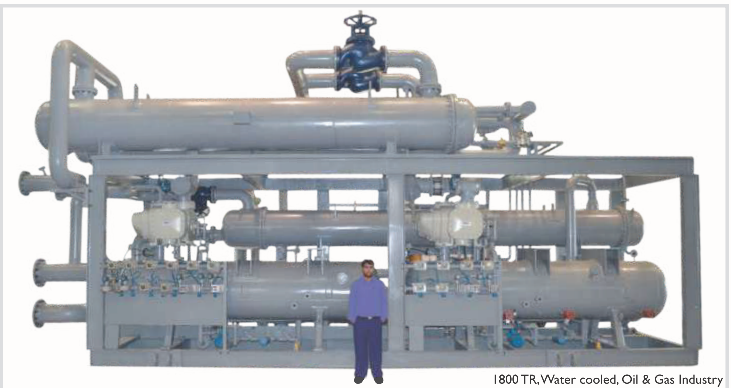
1800 TR, Water cooled, Oil & Gas Industry