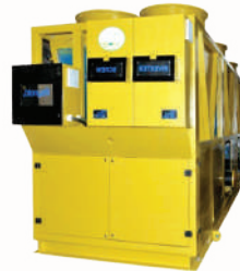
Variable Speed Air Cooled Screw Chiller